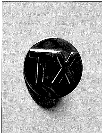
Fig. 4-2, Enlisted TX Disc Insignia

4. RESPONSIBILITIES. TXSG Leaders will enforce this uniform requirement throughout their organizations.