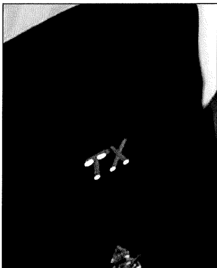
Fig. 4-1, Officer TX Insignia

f. Components will coordinate with the J4, TXSG for purchase and supply of "TX" collar insignia.