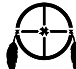
(53) FOUR DIRECTIONS