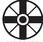
(24) THE CHURCH OF WORLD MESSIANITY