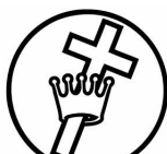
(47) FIRST CHURCH OF CHRIST, SCIENTIST (Cross & Crown)