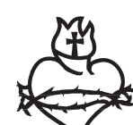
(62) Sacred Heart