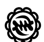
(63) African Ancestral Traditionalist