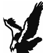
(52) LANDING EAGLE