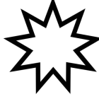
(15) BAHAI (9-Pointed Star)