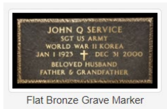
Flat Bronze Grave Marker

The flat bronze grave marker is 24 inches long, 12 inches wide, with 3/4 inch rise. Weight is approximately 18 pounds. Anchor bolts, nuts and washers for fastening to a base are furnished with the marker. Additional inscription is limited to 27 characters (including spaces) up to two (2) lines maximum. TMD does not furnish a base.