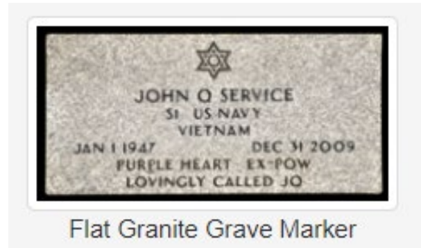
Flat Granite Grave Marker

The flat granite and flat marble grave markers are 24 inches long, 12 inches wide, and 4 inches thick. Weight is approximately 130 pounds. Variations may occur in stone color; the marble may contain light to moderate veining. Additional inscription is limited to 27 characters (including spaces) up to two (2) lines maximum.