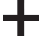
(14) GREEK CROSS