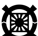
(56) UNIFICATION CHURCH