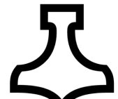
(55) HAMMER OF THOR