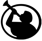
(11) MORMON (Angel Moroni)