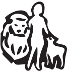
(20) COMMUNITY OF CHRIST