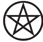
(37) WICCA (Pentacle)