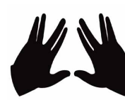
(45) KOHEN HANDS