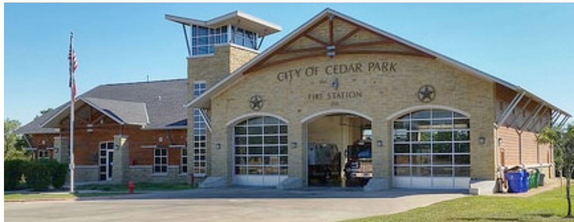
Fire Stations and/or EMS stations