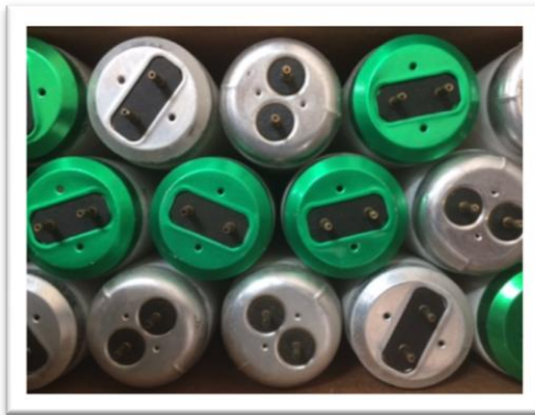
Fluorescent Light bulbs