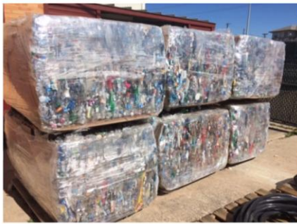
Plastic Bottles and Aluminum Cans

All material sold by the QRP is sold as scrap, priced per pound.