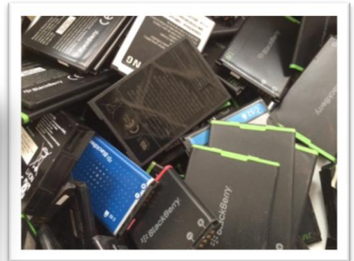
Cell Phone Batteries