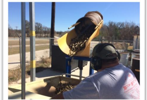
Range Debris (brass)