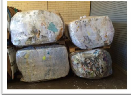
Office and Mixed Paper

Diverting reusable, recyclable material from landfill waste saves the TMD significant disposal costs.