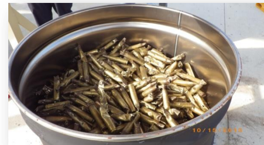
Deformed brass is repackaged into sealed barrels for sale

For persons interested in purchasing once-fired military brass there are numerous on-line retailers to choose from. The QRP is not authorized to sell undeformed brass for reloading.