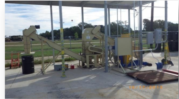
The brass deformer at Camp Swift

Range residue is an important commodity for the QRP, contributing the largest portion of the QRPs annual revenue