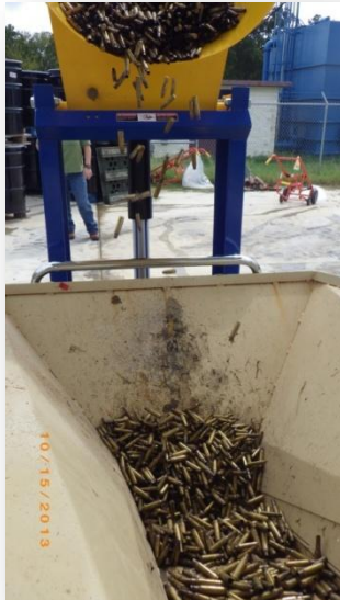
Barrels of brass are dumped into the deformer hopper

Small arms brass from our five TMD training areas is brought to Camp Swift for processing. The QRP must meet numerous requirements in order to conduct the sale of range residue.