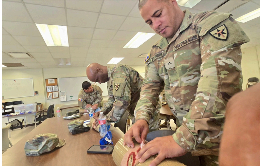
"Alamo Guard's" 4th Battalion completed Stop the Bleed training during October drill at Martindale Army Heliport, strengthening lifesaving readiness for future missions.

Texas State Guard leaders congratulated all participants who successfully completed the engineering pre-vetting test and advanced to the next stage of mission support.