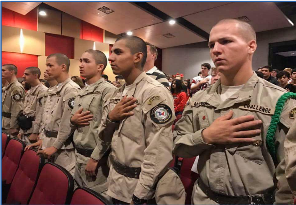
A YOUTH EDUCATION PROGRAM OF THE TEXAS NATIONAL GUARD FOR AT-RISK TEENS