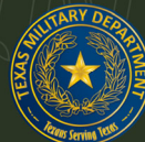
Command Picture

OLS LEADERSHIP CONFERENCE EAGLE PASS TX 02OCT-03OCT 2024