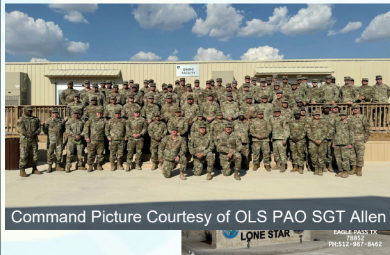
Command Picture

OLS LEADERSHIP CONFERENCE EAGLE PASS TX 02OCT-03OCT 2024